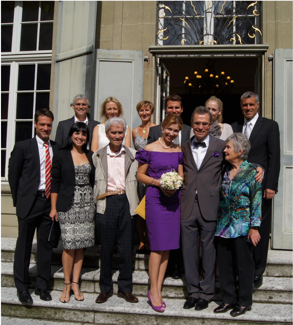
Family & life-time friends @ wedding in July 2011